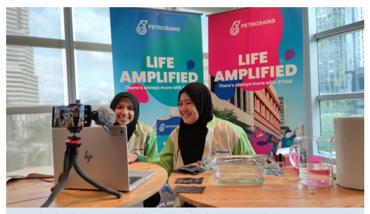
Petrosains, The Discovery Centre celebrates its 22nd anniversary on March 25

PETROSAINS was established by PETRONAS in 1999 as a platform for presenting STEM (Science, Technology, Engineering and Mathematics) in an exciting and stimulating way that makes a lasting impression.